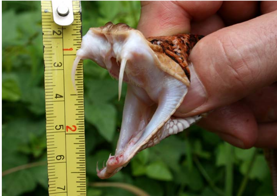
Figure 5. At even 9-months age a bushmaster has enormous fangs! A finger could be pieced through, with intramuscular injection a near certainty in a hand or foot. Photo Regina Ripa. Cape Fear Serpentarium.

He is a fool who injures himself by amassing things. And no one knows why people cannot help but do it. — Danse Macabre