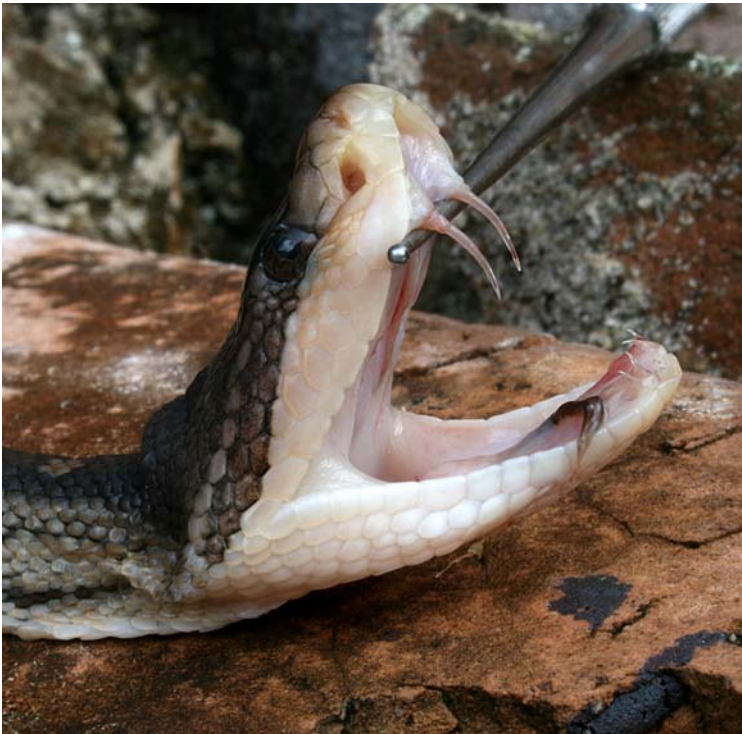
Figure 2. A 1-day-old neonate showing fangs, which are 7 mm long in this 46 cm long specimen. Subcutaneous envenoming by neonates should not be deadly to adult humans, despite intense pain and dramatic edema. Severity of envenoming is probably related to route, with the more serious intramuscular inoculation likely only in the digits (in bites by neonates). At age 2 months, however, the hatch-size is doubled, and here i.m. injection is possible. Case 4 reports an example producing very dramatic systemic effects, which could have led to death.