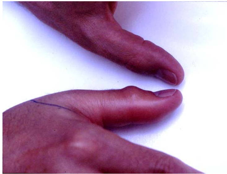
Figure 3. Minimal edema of thumb at 20 minutes post-bite in neonate Bite 1. Edema would increase over the next hours, surpassing the elbow. In bushmaster bite, severe systemic manifestations may precede extreme edema. If there is no swelling within 30 minutes of the bite, envenomation has probably not occurred. In this case, the damage remained local and no systemic effects developed.

curate as any written to date. The lividness and the deforming swelling as the black-blistered flesh explodes from the outward pressure; the mouth spitting up bloody threads; the unendurable pain and the eyes literally weeping blood; and finally, the awful sweat of “red pearls” signalling the end is near. For the professional snake handler there is the added irony of having been warned well ahead of time. Your sense of humor survives you, tugging on your i.v. line like a mocking old devil to remind you of your folly: “Play with snakes, would you! Well, we told you so! Why didn’t you listen?!” You wave your rotting arm in protest, mouth mucking through the blood, “I thoth them beauthiful!”